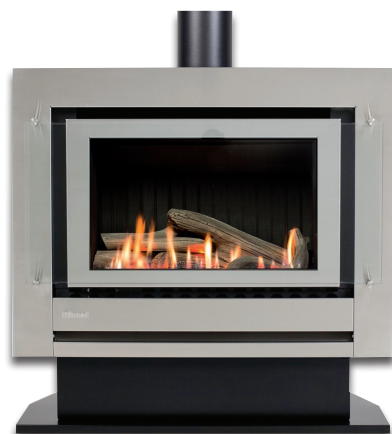
Stainless Steel Freestanding Plinth