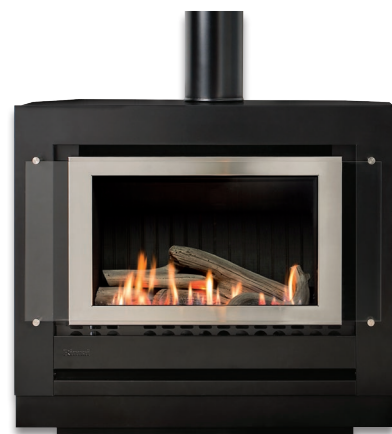
Stainless Steel on Black Freestanding Floor